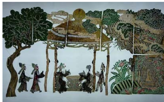
(b) Shadow play